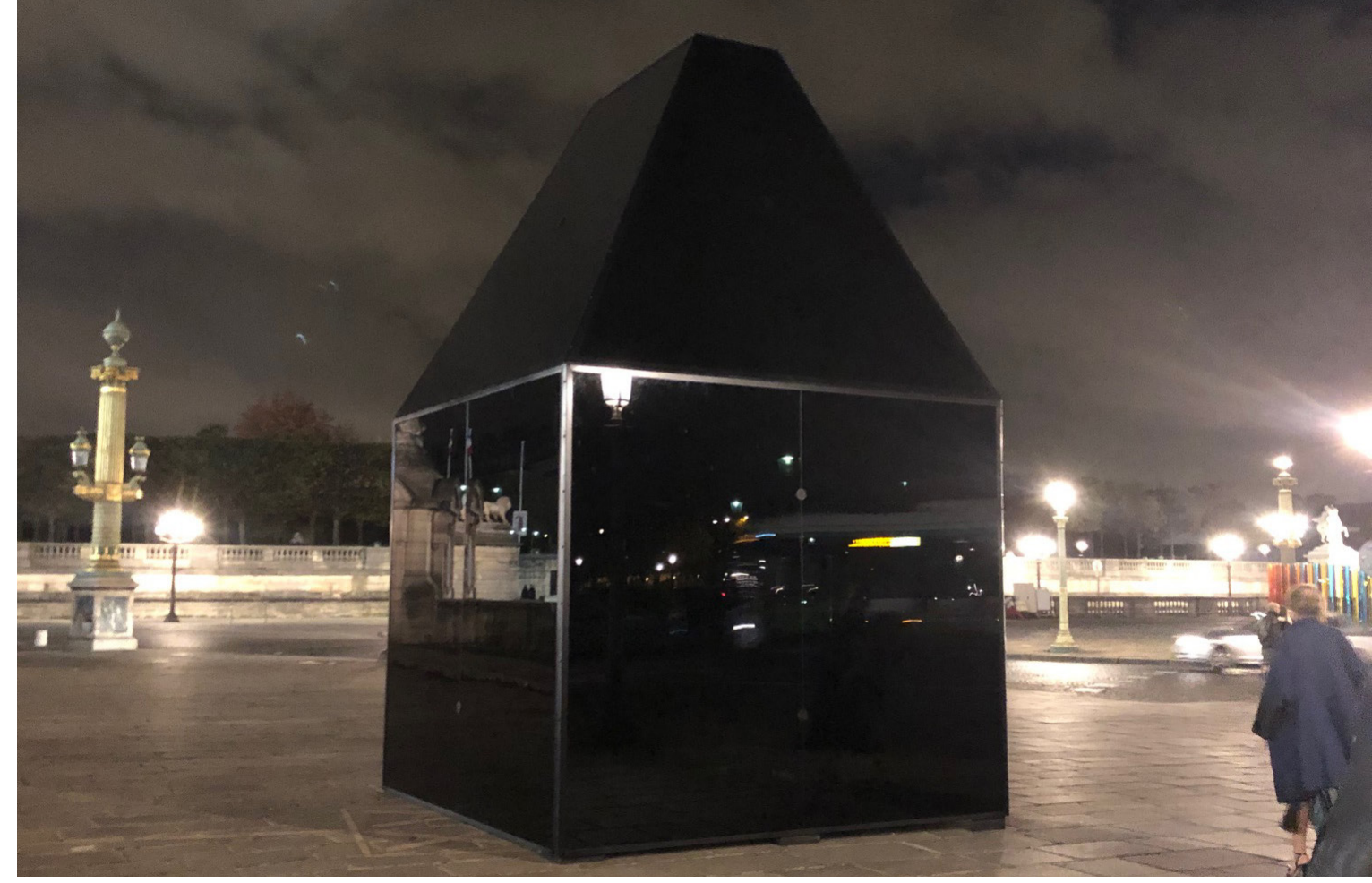
"Black Pavilion", installation at Place de la Concorde, FIAC Hors les murs 2019